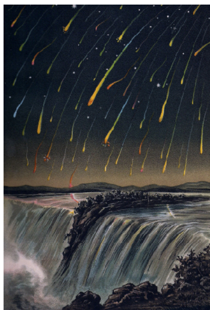
Figure 14.4 Leonid Meteor Storm. A painting depicts the great meteor shower or storm of 1833, shown with a bit of artistic license.

The most dependable annual meteor display is the Perseid shower, which appears each year for about three nights near August 11. In the absence of bright moonlight, you can see one meteor every few minutes during a typical Perseid shower. Astronomers estimate that the total combined mass of the particles in the Perseid swarm is nearly a billion tons; the comet that gave rise to the particles in that swarm, called Swift-Tuttle, must originally have had at least that much mass. However, if its initial mass were comparable to the mass measured for Comet Halley, then Swift-Tuttle would have contained several hundred billion tons, suggesting that only a very small fraction of the original cometary material survives in the meteor stream.