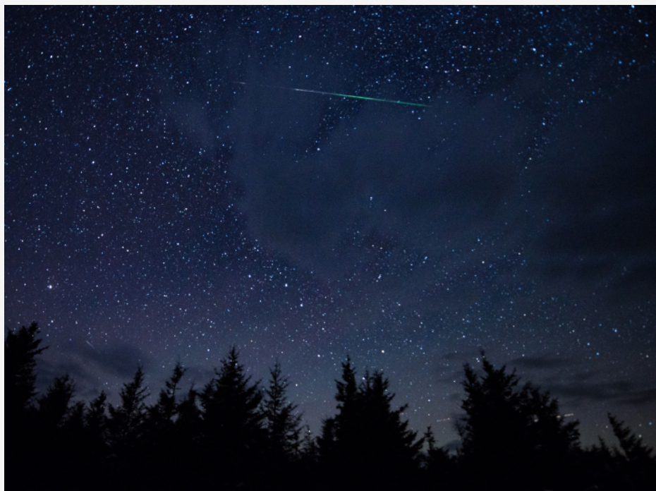
Figure 14.5 Perseid Meteor Shower. This twenty-second exposure shows a meteor during the 2015 Perseid meteor shower.

Observing a meteor shower is one of the easiest and most enjoyable astronomy activities for beginners (Figure 14.5). The best thing about it is that you don't need a telescope or binoculars—in fact, they would positively get in your way. What you do need is a site far from city lights, with an unobstructed view of as much sky as possible. While the short bright lines in the sky made by individual meteors could, in theory, be traced back to a radiant point (as shown in Figure 14.3), the quick blips of light that represent the end of the meteor could happen anywhere above you.