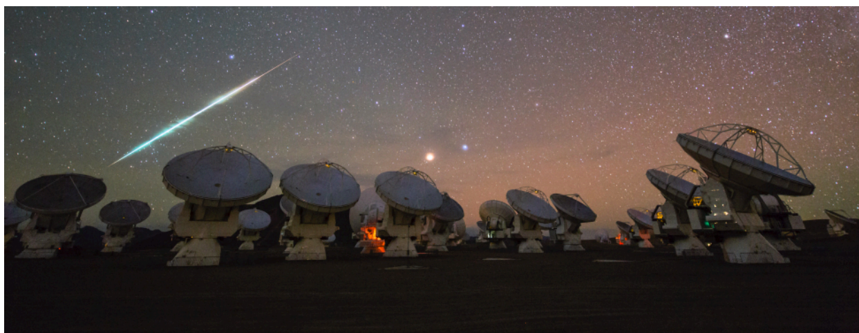
Figure 14.2 Fireball. When a larger piece of cosmic material strikes Earth's atmosphere, it can make a bright fireball. This time-lapse meteor image was captured in April 2014 at the Atacama Large Millimeter/Submillimeter Array (ALMA). The visible trail results from the burning gas around the particle.